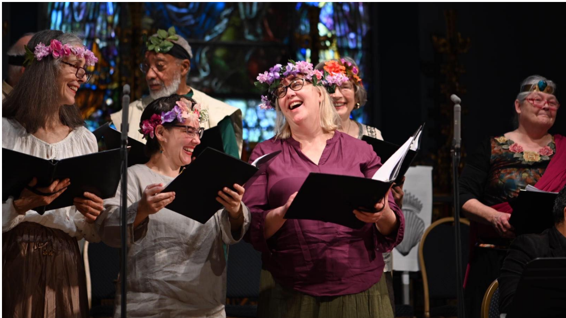
Crescendo Singers in Acis y Galatea